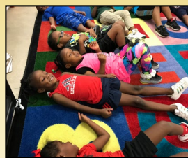
Students stretch during Week of the Young Child exercise day.

HCDE Head Start celebrates Week of the Young Child this week with celebrations at each of the centers and community tours at the Fonwood and Sheffield locations.