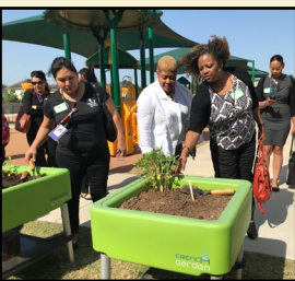
Center staff and community partners check out the mini gardens planted on the campus.

HCDE Head Start celebrates Week of the Young Child this week with celebrations at each of the centers and community tours at the Fonwood and Sheffield locations.