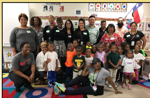
Community partners pose for a group photo after touring a Head Start classroom.

Week of the Young Child is an annual celebration hosted by the National Association for the Education of Young Children (NAEYC) celebrating early learning, young children, their teachers and families.